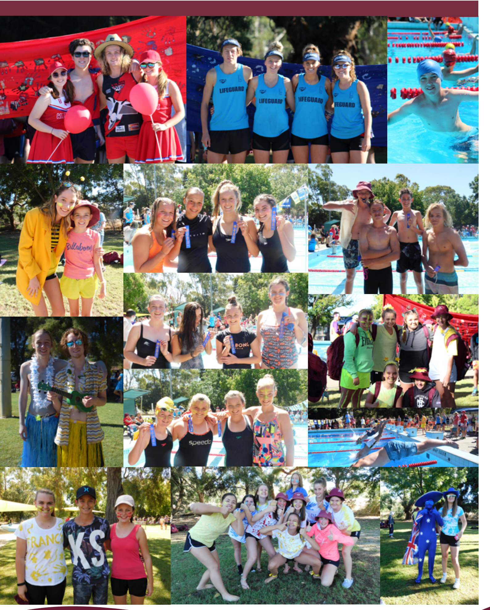
Take a look at more great photos on our Facebook page https://www.facebook.com/stmarysnathalia/