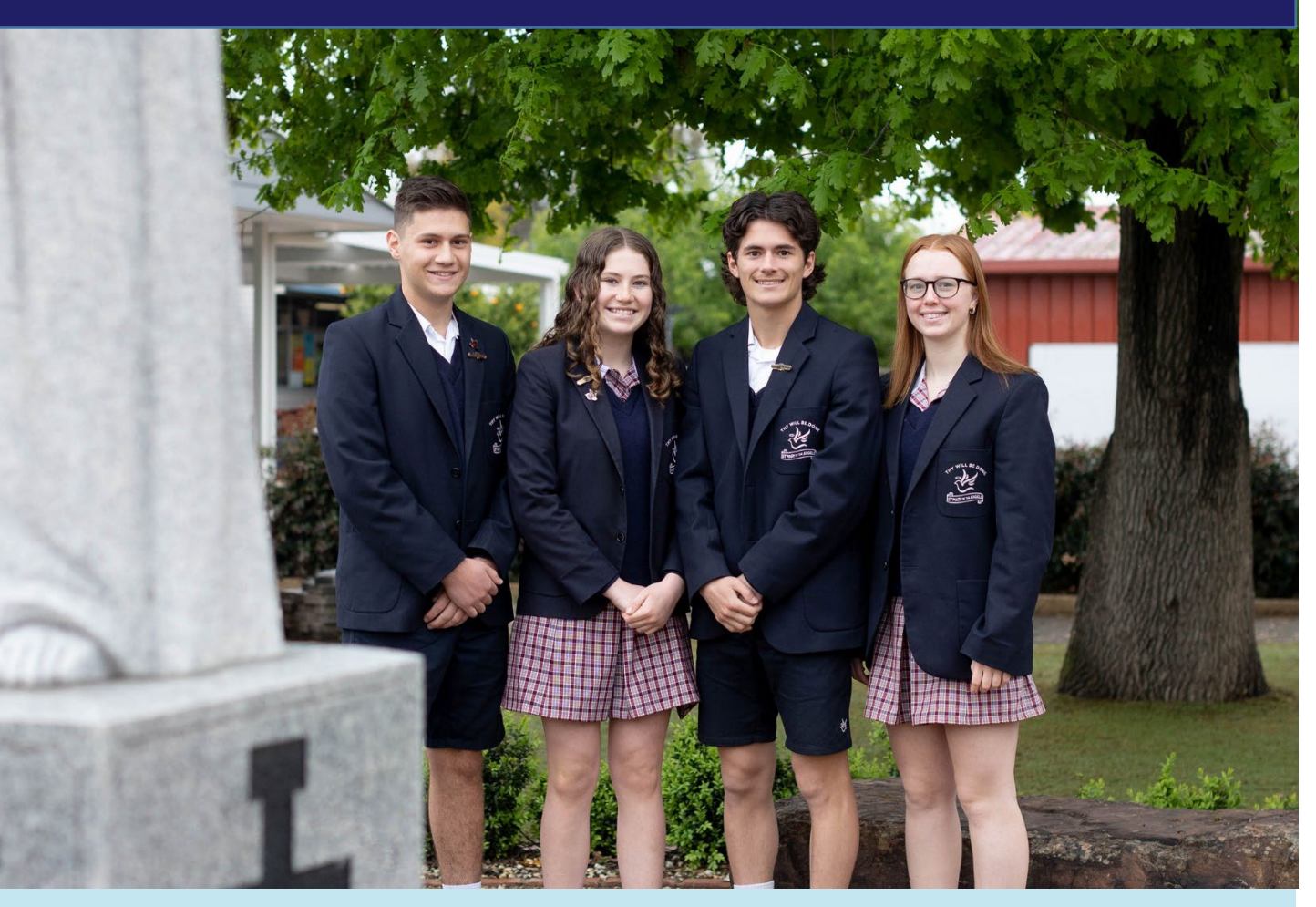
Registered School Number: 1605